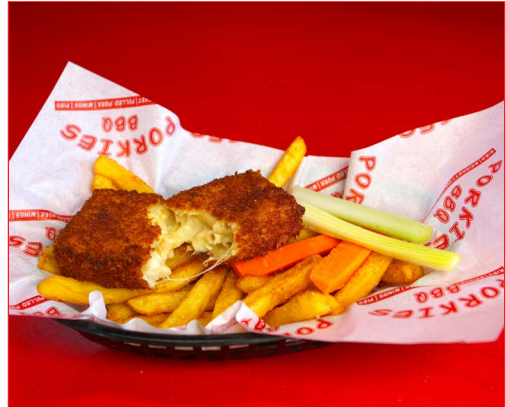
MAC N CHEESE