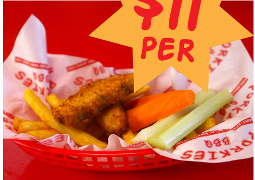
HOMEMADE CHICKEN NUGGETS (2) PIECES